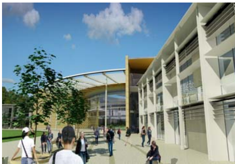
Above: Main Entrance Below: ICT Suite